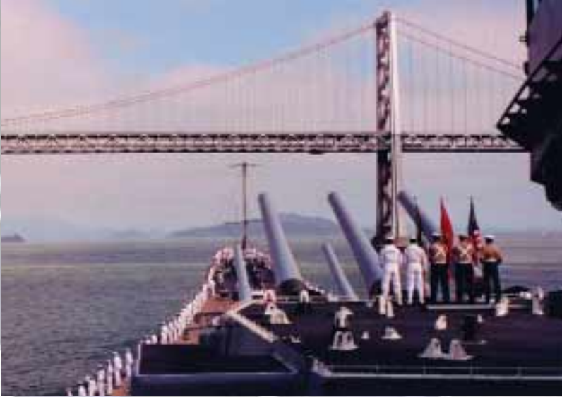
The “Mighty Mo” (USS Missouri) outbound from San Francisco Bay, June 1990.