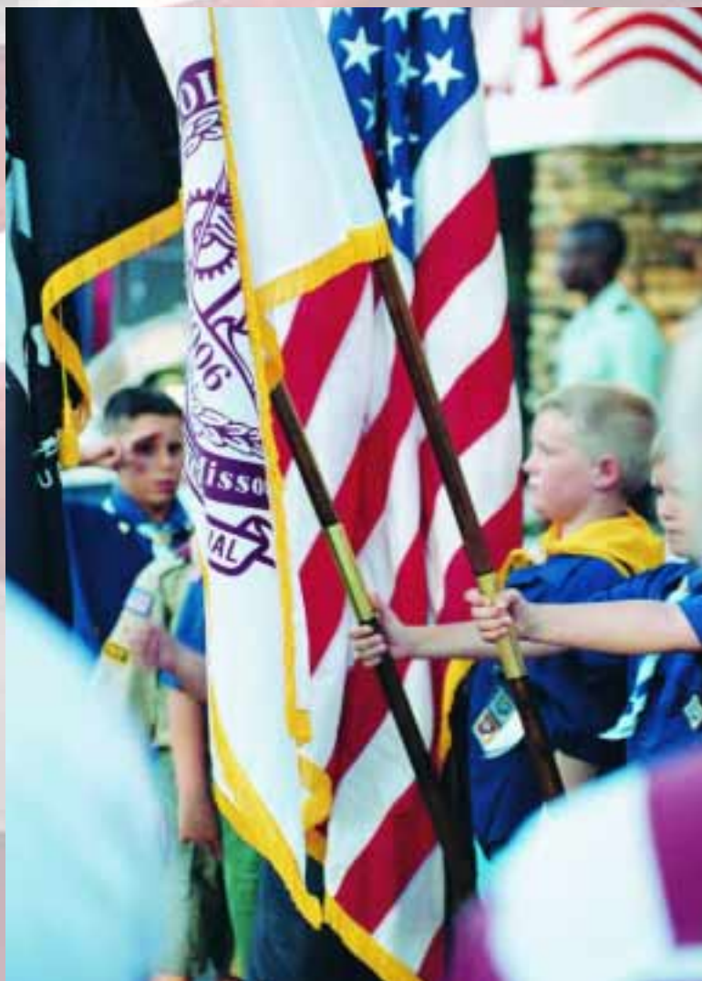
Cub Scout color guard at College of the Ozarks Independence Day celebration, July 1, 2001.