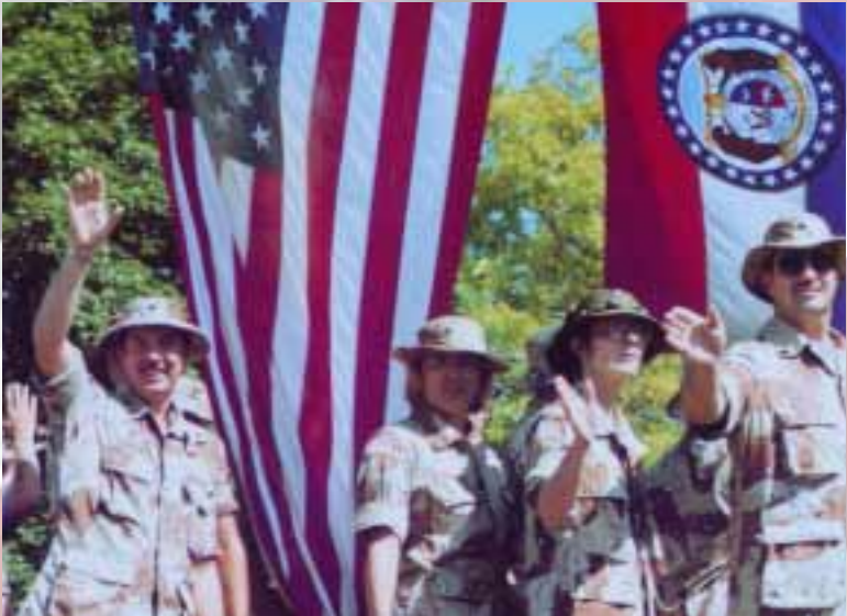
Veterans of the Persian Gulf War during President and First Lady Barbara Bush’s Independence Day, 1991 visit to Marshfield, MO.