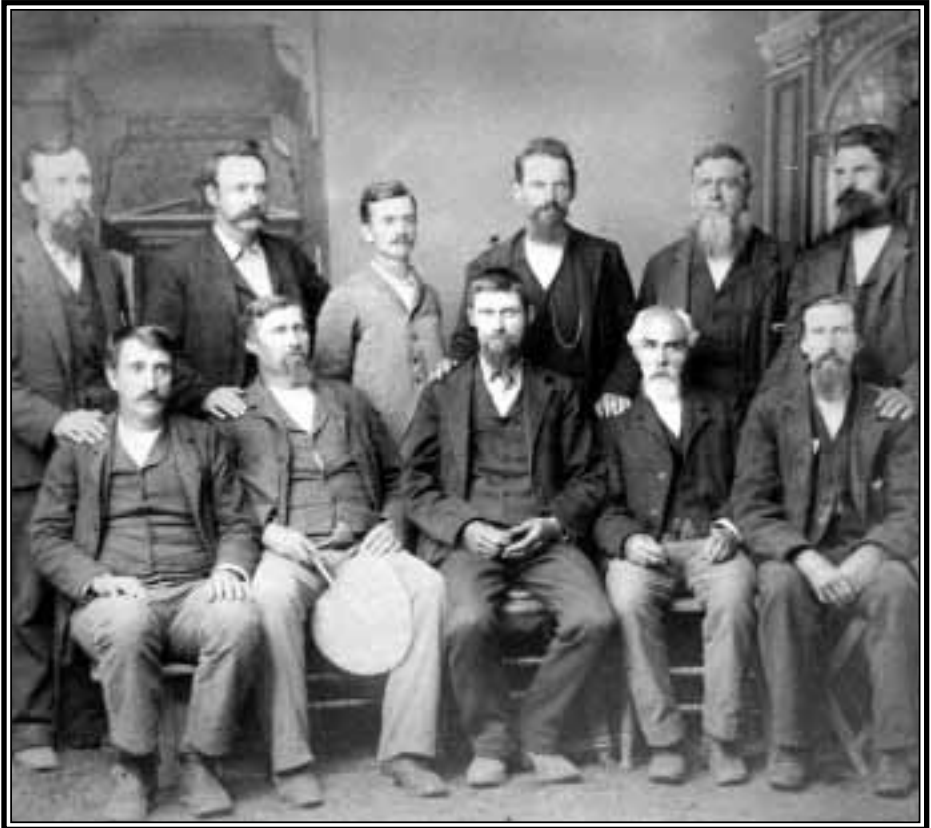
Knox County Judges, 1882.