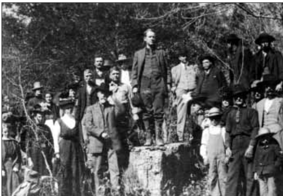
Governor Herbert Hadley Ozark Exploration on the Current River, Oct. 1909.