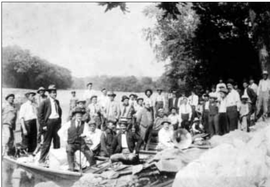
Governor Herbert Hadley Ozark Exploration on the Current River, Oct. 1909.