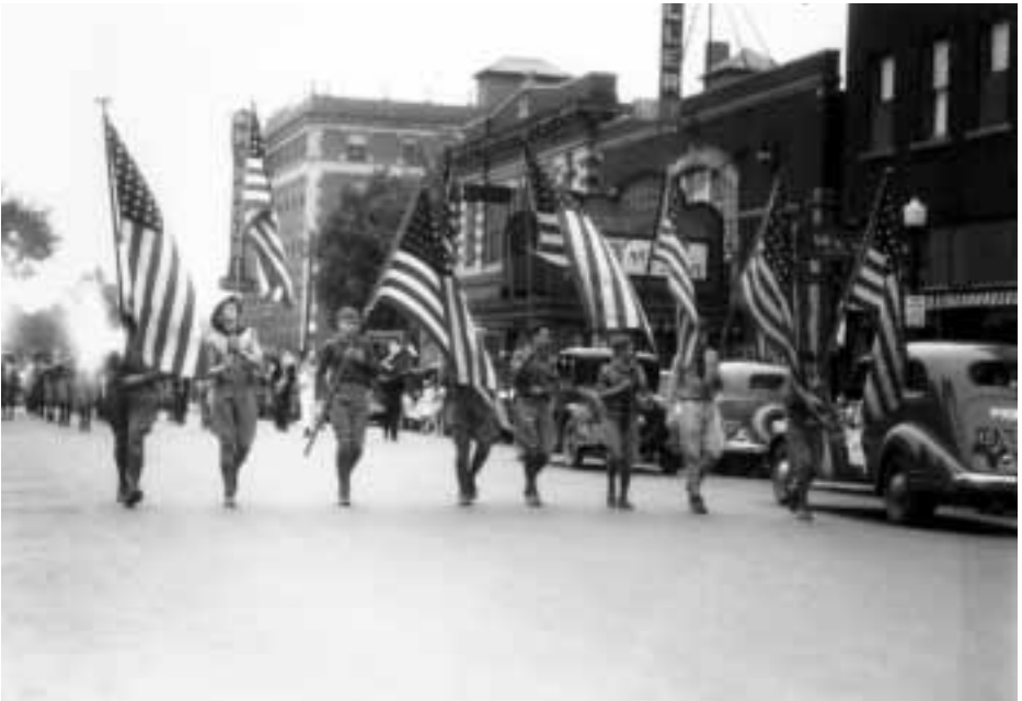
Governor Guy B. Park inaugural parade on High St., January 1933.