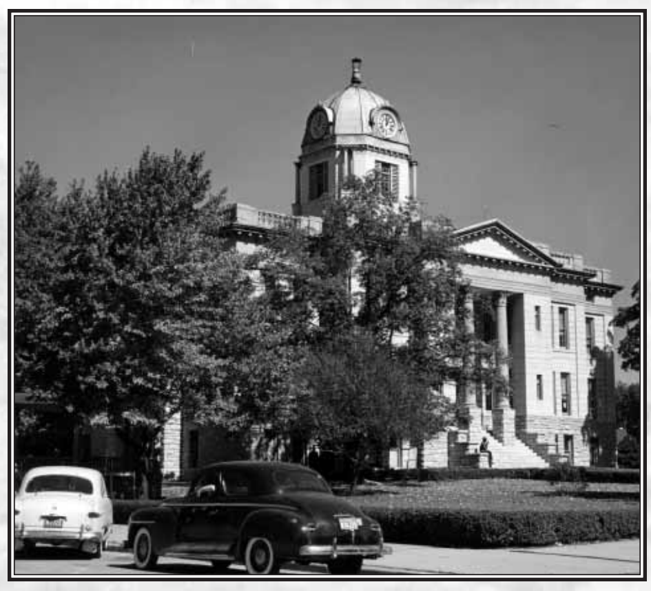
Jackson County Courthouse, c1950.