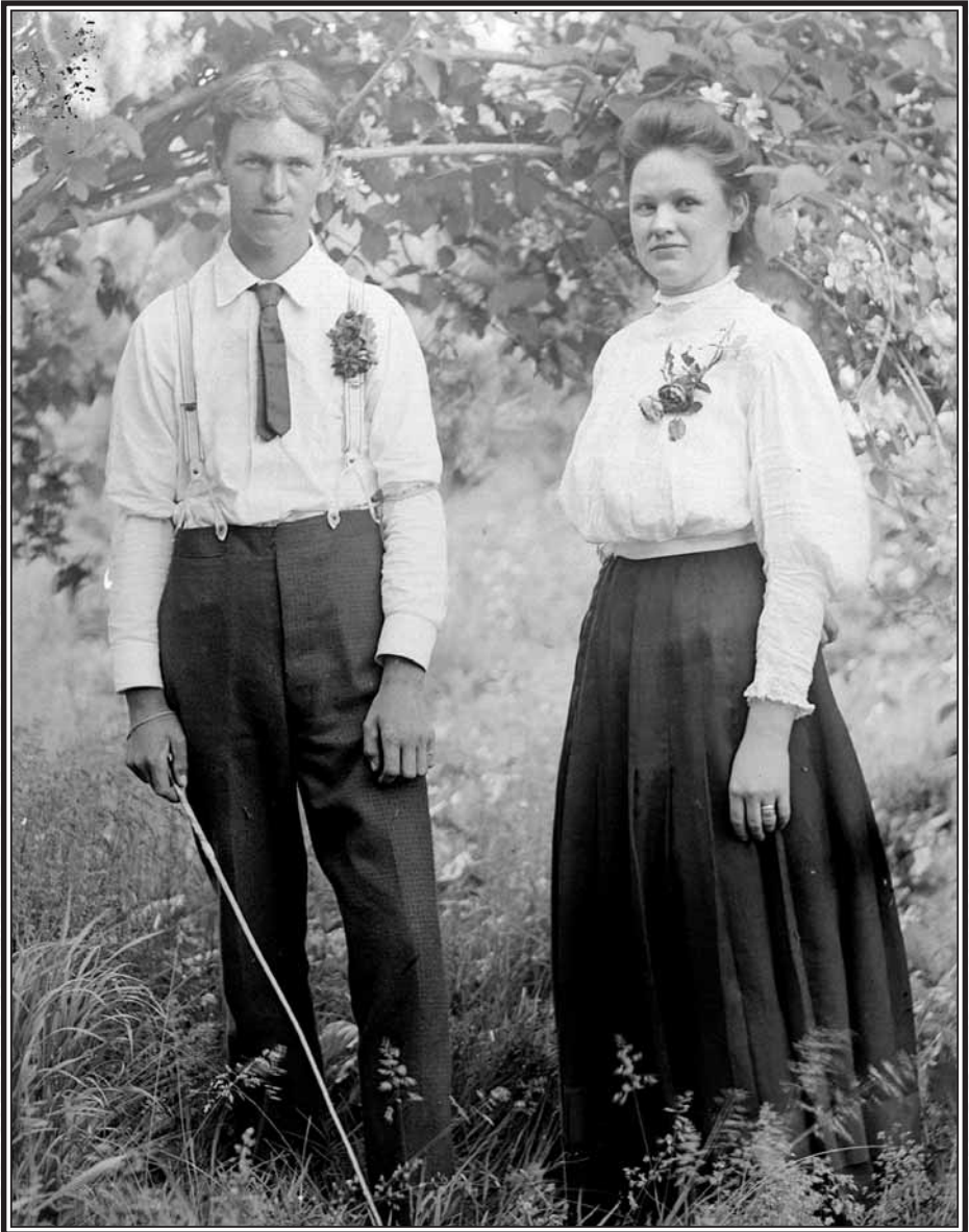
Portrait of a young couple, c1910