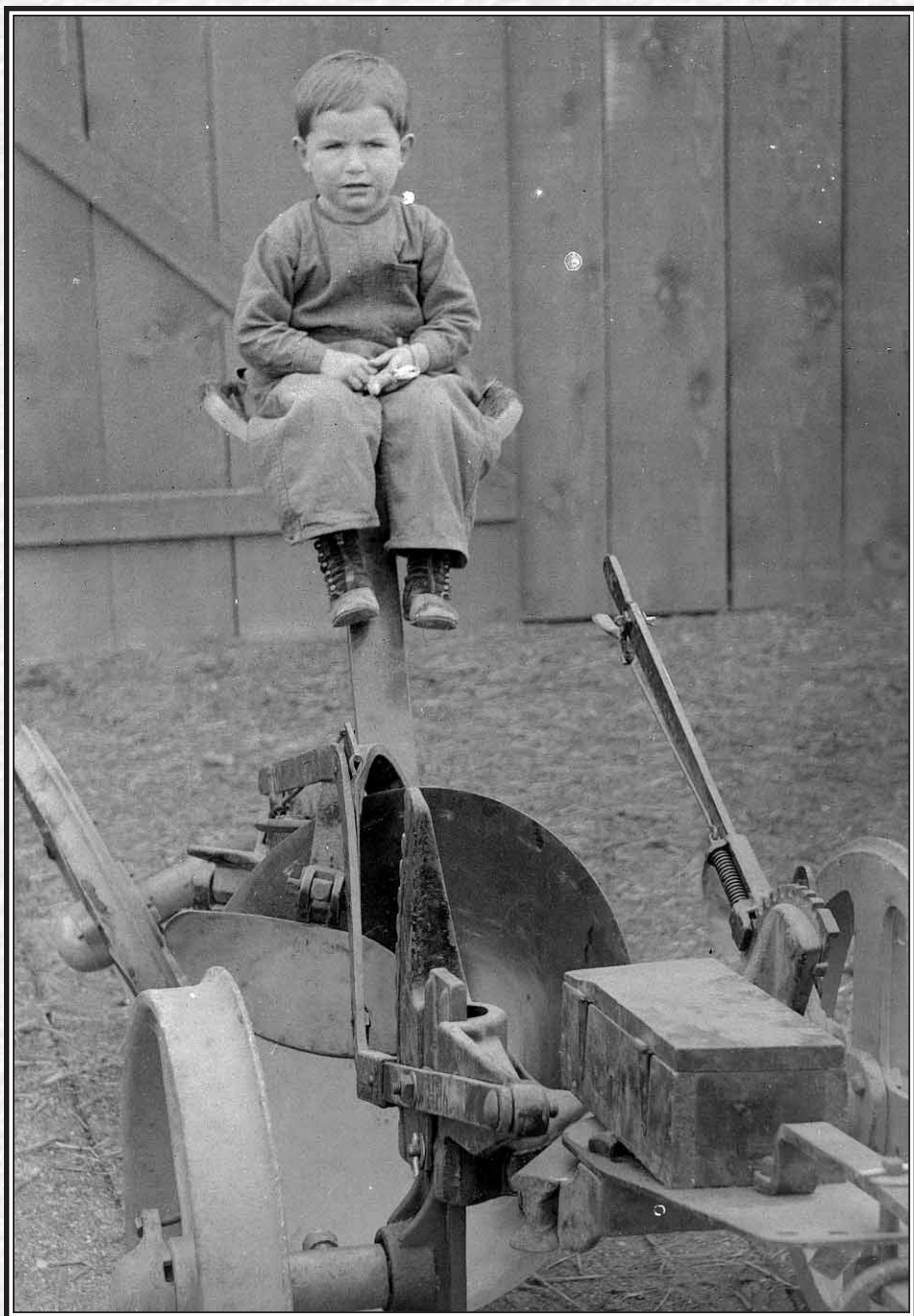
Young boy on a plow, c1900