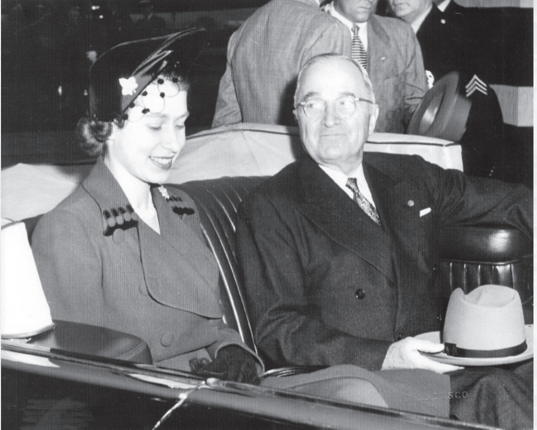
Truman with H.R.H Princess Elizabeth, 1951