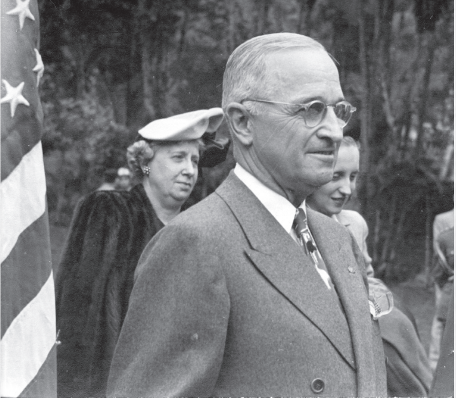
President Harry S. Truman, Bess Wallace Truman, and Margaret Truman in Rio de Janeiro, Brazil.