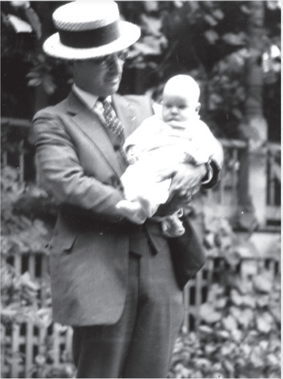
Truman holding his daughter, Margaret