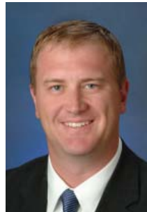
SEN. ERIC SCHMITT Member Missouri Tourism Commission

The strategic marketing plan is the roadmap that guides all marketing efforts of MDT and has