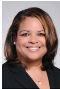
SEN. KIKI CURLS Member, Women's Council