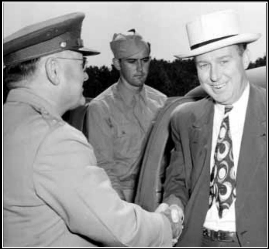
Congressman Dewey Short visits Camp Crowder, August 26, 1943.