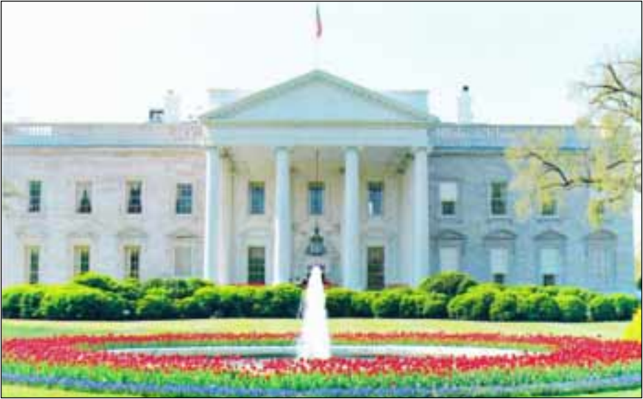
The White House, Washington, D.C.

elects a president pro tem of the Senate to serve in the absence of the vice president. The president pro tem also represents the party in power and earns $161,200. The presiding officer of the House is called the speaker. The speaker traditionally represents the party in majority and earns $186,300.