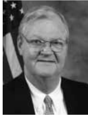
Elected to the Missouri Senate: