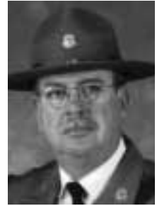
CAPT. VINCENT J. ELLIS Troop A Missouri State Highway Patrol

marijuana, 198 pounds of cocaine, and 17 pounds of methamphetamine in addition to quantities of other illegal drugs such as heroin. In 2000, 2,887 methamphetamine investigations were conducted, leading to the seizure of 589 clandestine methamphetamine laboratories.