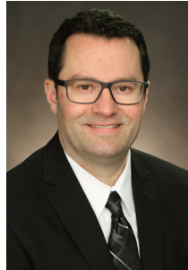
CRIS STEVENS Deputy Attorney General for Criminal Litigation